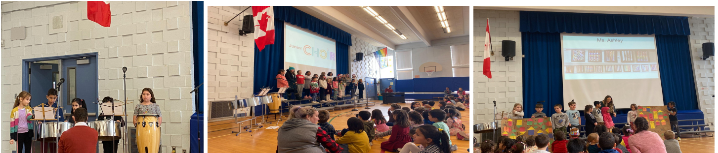
Student performances during our December assembly allowed students to demonstrate the use of a variety of instruments and showcase the learning in classes.

We want to thank families and friends for joining us on Thursday for our December Assembly. We hope this was an opportunity for you to see what we enjoy seeing at the end of each month from our students. Our assemblies are an opportunity for each classroom to share their achievements and classroom goals and share what they have been working on over the past month. This is an opportunity for our school to come together as a community of care and support each other in celebrating each other's achievements.